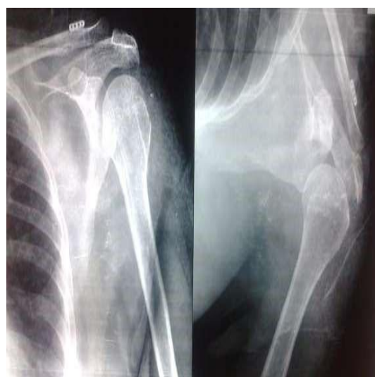
Intraoperative Image and Post Operative X-Ray of Mersilene Tape with Endobutton in Loop Fixation Technique

Then torn ligaments were repaired. Deltotrapezius fascia repaired and wound closed in layer.