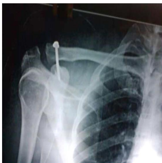
Intraoperative Image and Post Operative X-Ray of CCS with Washer in Transfixation Screw Technique