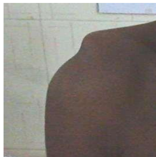
Clinical Photograph Showing Prominence of Lateral end of Clavicle Indicating AC Joint Dislocation