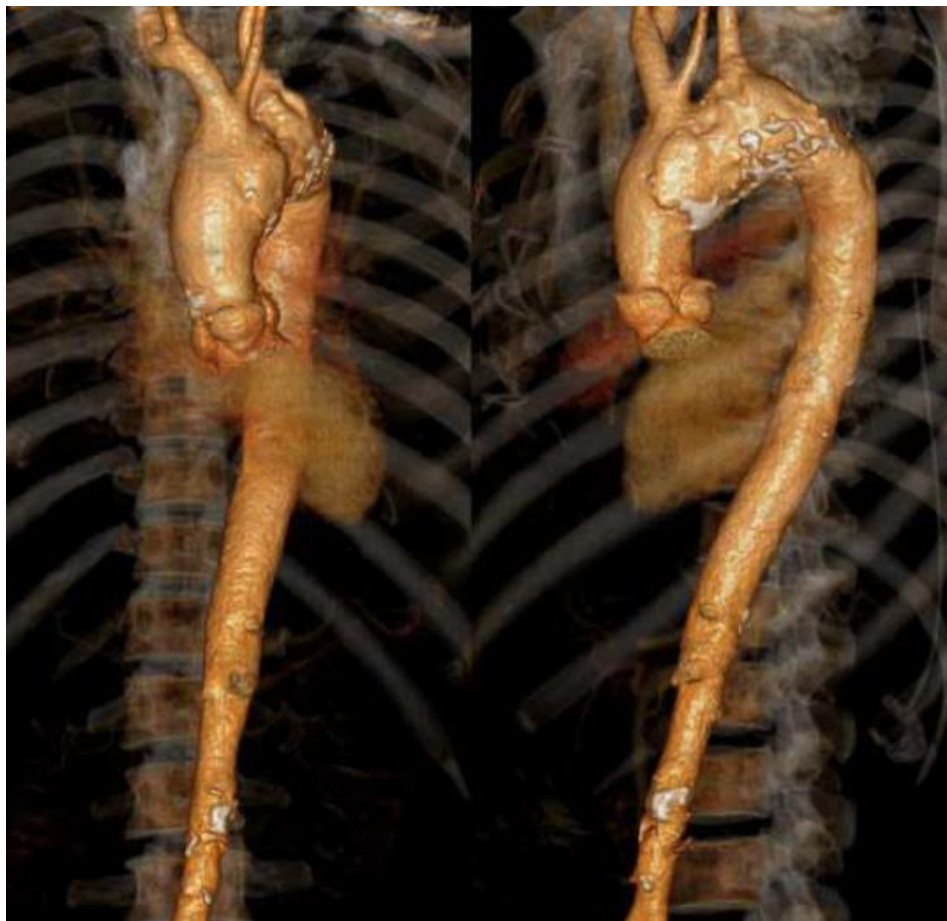
Figure-3 Computer tomography showing postoperative repaired aortic arch