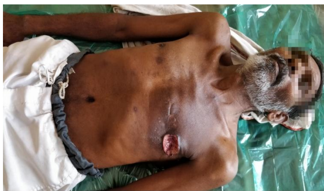
Figure 1: Ulcer on Left Breast

There was a 5 x 4 x 4 cm ulcer over the left breast overlying the scar of previous mastectomy. The ulcer had irregular margins, indurated edges, slough over the floor with serosanguinous non foul smelling discharge & was fixed to the chest wall. He had multiple hard, immobile left axillary palpable lymph nodes.