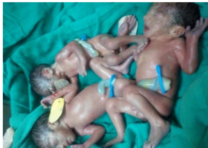
Figure 1- Three live babies of quadruplet pregnancy (two male and one female)

to Neonatal Intensive Care Unit and discharged after 4 days) and one male dead fetus [Fig-1]. The birth weight of the two male and one female baby were 1700 gm, 1500 gm and 1350 gm respectively. The male still born weighed 900 gm. Placenta was found to be quadrichorionic quadriamniotic [Fig-2,3]. Intra operative and postoperative period were uneventful. Patient was discharged from hospital with three live babies on seventh postoperative day.