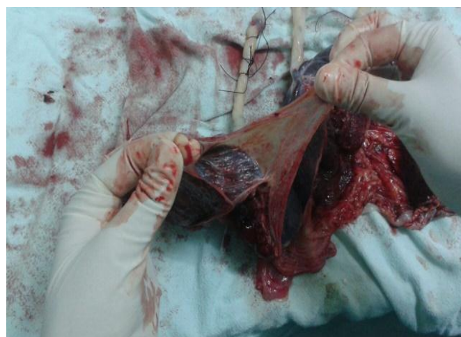
Figure 2- Quadrichorionic quadriamniotic placenta